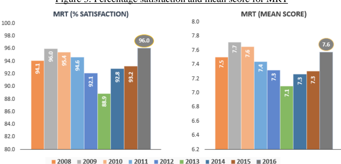
Figure 3: Percentage satisfaction and mean score for MRT

Satisfaction with MRT services also registered improvement, rising to 96.0% in 2016, up from 93.2% a year ago. The mean satisfaction score also rose, reaching 7.6 in 2016, up from 7.3 in 2015. The improved satisfaction with MRT services was largely driven by improvements in the areas of comfort, travel time and waiting time. Satisfaction with rail reliability has also improved.